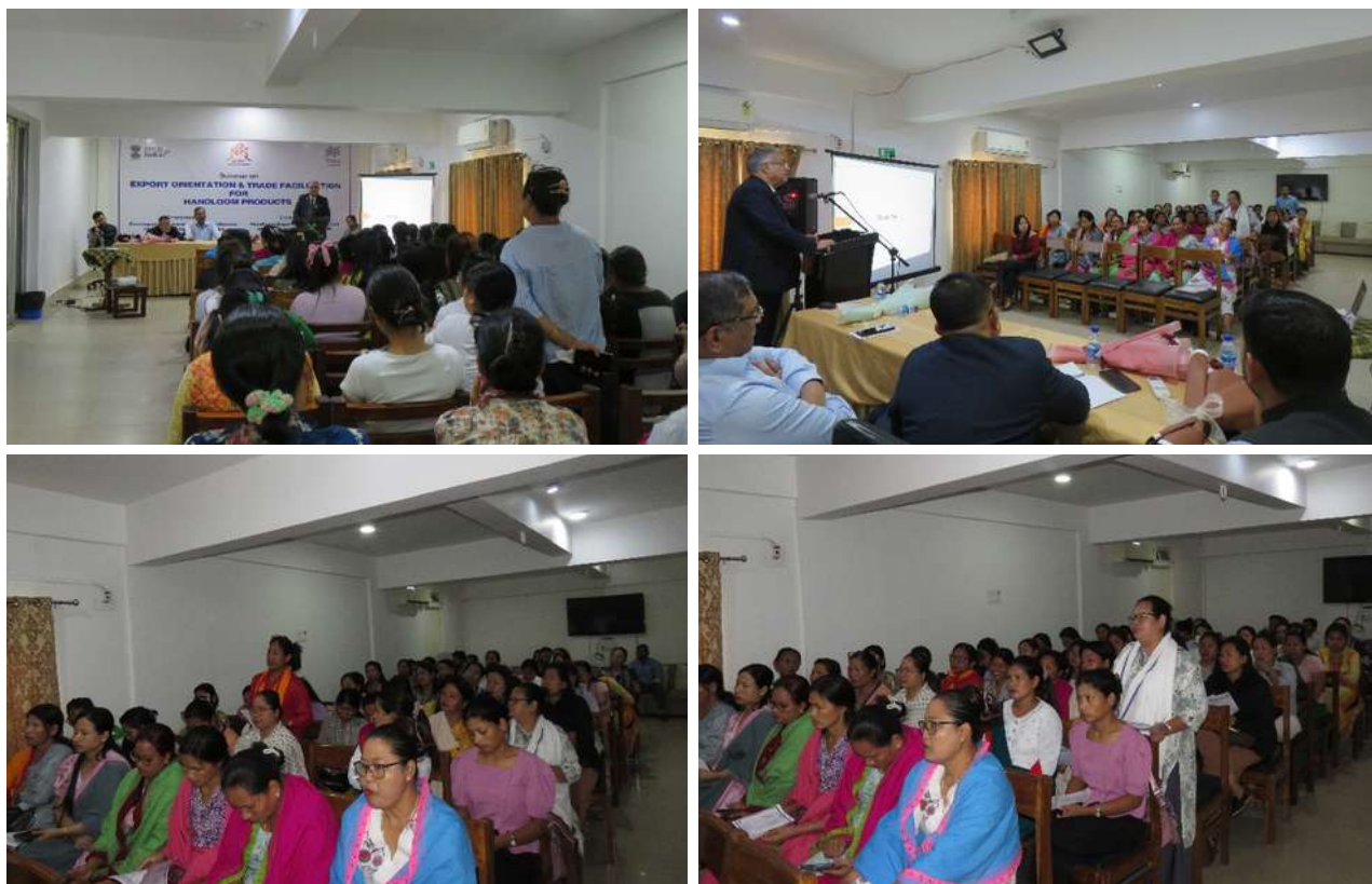
Participants interacting with the Speakers

The session was highly engaging, and participants raised their queries and doubts which were addressed by the speakers immediately. The discussions reflected the keen interest among the weavers to explore export opportunities while also highlighting the need for guidance and continuous support.