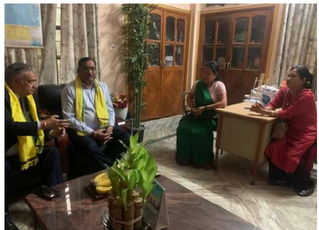
Glimpse of Cluster Visit